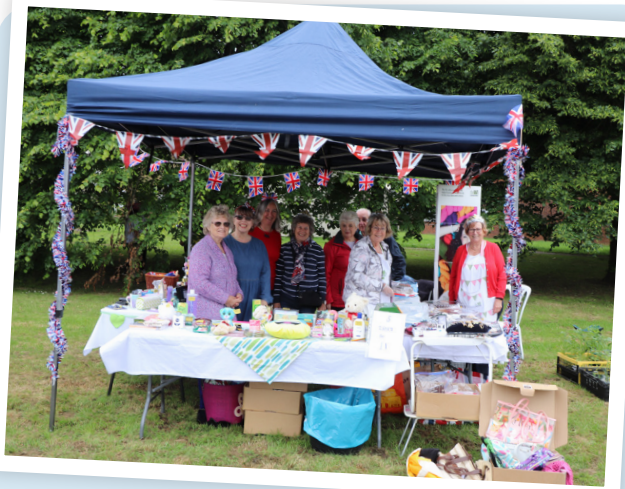
The SWAN WI stall outdid themselves, showcasing their talents with craft, plants and of course their very popular cakes. The tombola sold out and was a huge success.