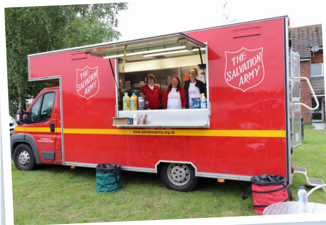
The Salvation Army started proceedings with a short service of reflection and thanksgiving for the Queen and prayers for the day ahead.