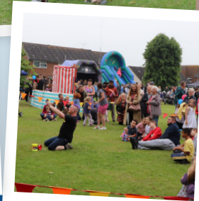
Circus skills had everyone on their feet involved spinning plates and much more