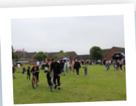
The Green Rapidly filled up it was wonderful to see so many different ages, families and of course well behaved dogs.