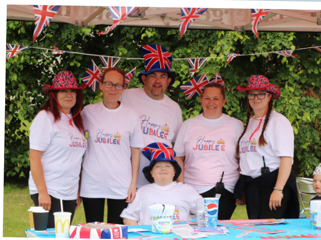
The Salvation Army stall brought children many goodies including Jubilee crafts