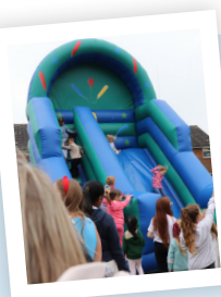
The Bouncy Castles from Ashford Inflatables were in constant use